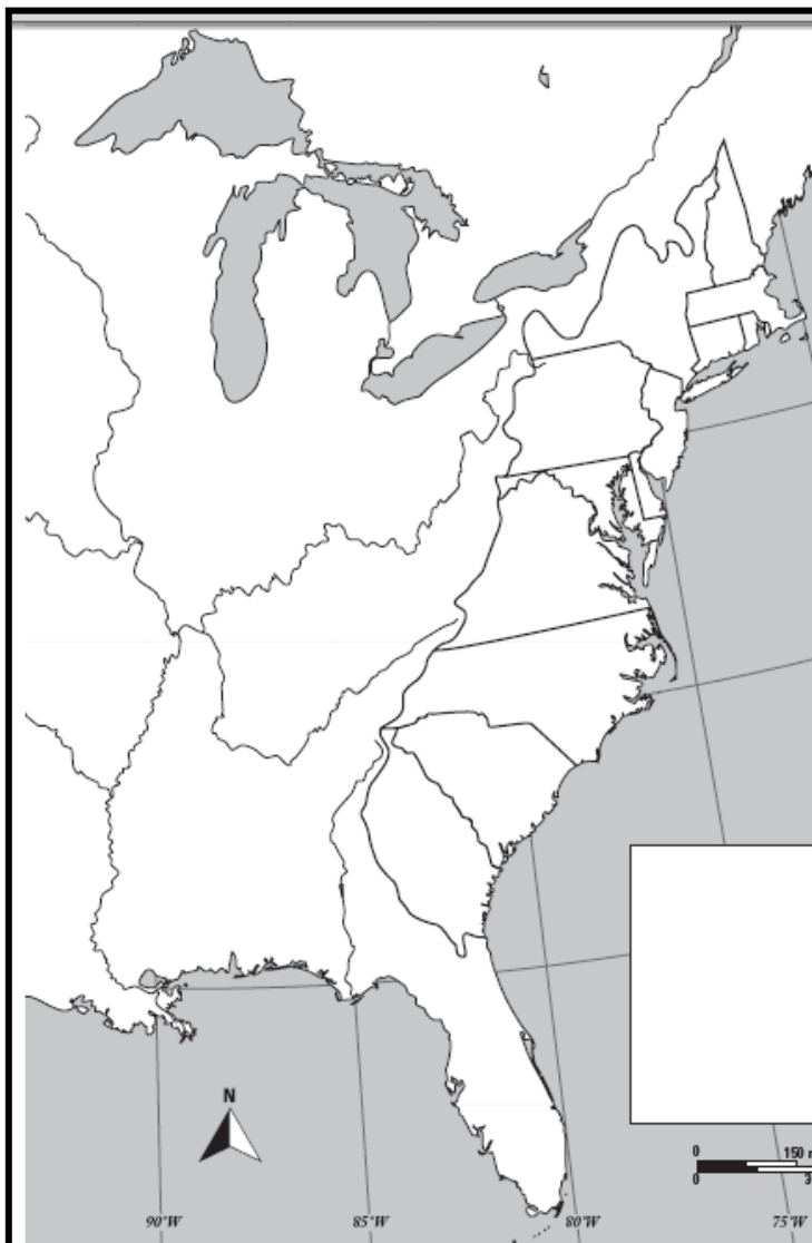
North America in 1750