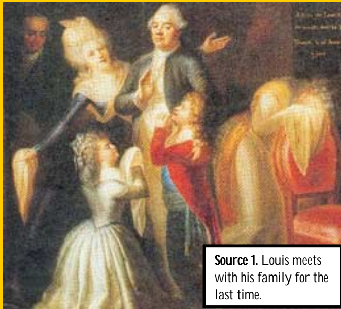
Source 1. Louis meets with his family for the last time.

21 st January 1793 – the day of the execution – preparations are made: The Convention needed to make sure that Louis's execution went smoothly. Troops were stationed at the entrances to the city to prevent crowds from entering or leaving. 200 Mounted guards and 1200 foot soldiers were to surround Louis's coach. There were around 80,000 armed men in Paris to ensure that problems did not arise. Louis's own preparations included having a final meeting with his family (source 1), attending mass at 6 o'clock in the morning, and passing on instructions to Clery, his servant (source 2).