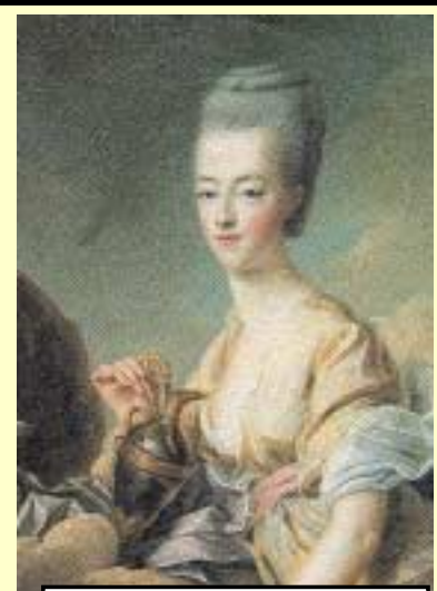
Source C. Queen Marie-Antoinette of France.