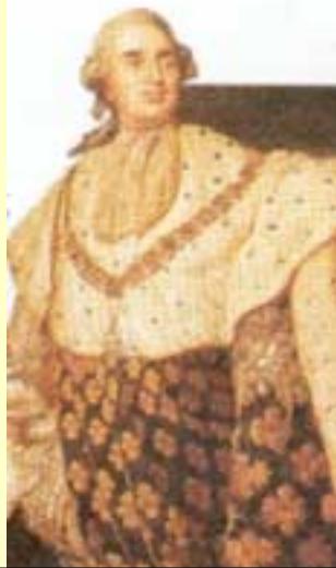
Source A. King Louis XVI of France